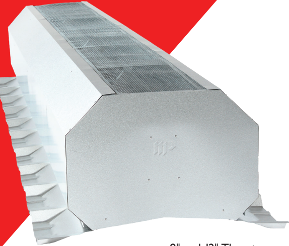
9" and 12" Throat Continuous Ridge Ventilators

Standard ridge ventilators are shipped with a 1:12 end cap and can be field modified to accommodate up to a 6:12 roof pitch. Ventilators can be custom ordered to accommodate roof pitches greater than 6:12.